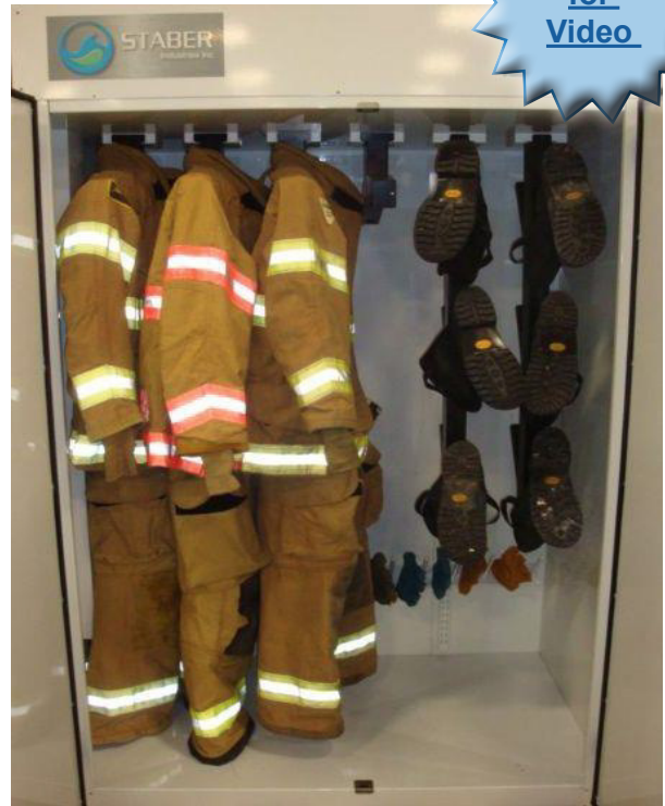
The Standard 2201-6