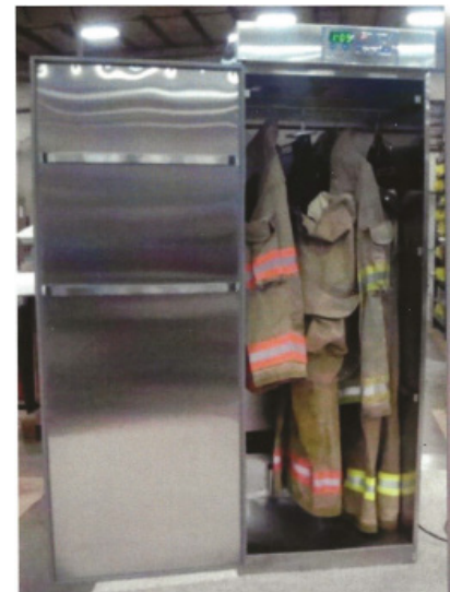
Model - FDCSS-2G with shelves removed