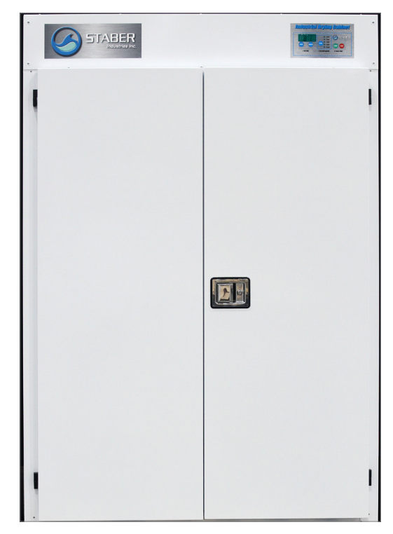
Model IDC-2230 (Powder Coat White)

If required, ease of maintenance is one of the benefits of the Staber Commercial Drying Cabinet's design. The cabinet is designed to be end user repairable. There is total front/top access to all replaceable parts and few overall moving parts. A Factory Customer Service representative is available during normal business hours (Monday through Friday, 8AM -3PM EST) and can be reached at 800-848-6200.