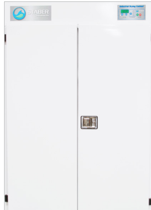
Model IDC-2230 (White Powder Coat Finish)

If required, ease of maintenance is one of the benefits of the Staber Commercial Drying Cabinet's design. The cabinet is designed to be end user repairable. There is total front/top access to all replaceable parts and few overall moving parts. A Factory Customer Service representative is available during normal business hours (Monday through Friday, 8AM - 3PM EST)" and can be reached at 800-828-6200.