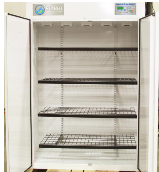
Model IDC-2230 (820330)

Ask us about our Turnout Gear Washer and Hose Washer