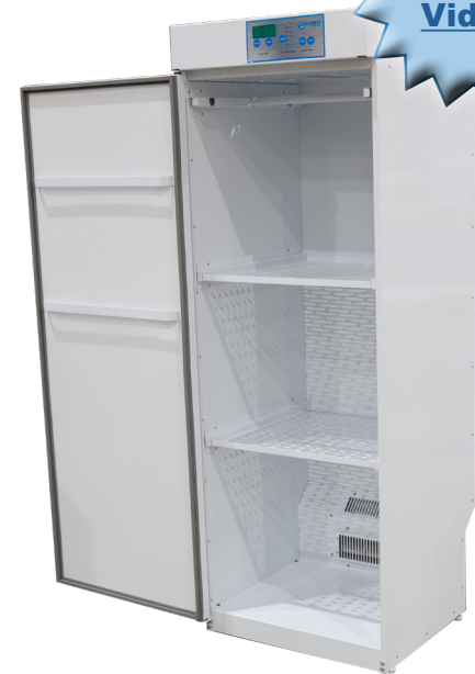
Model FDC-2G (820220I)

1 year from the date of purchase, when this drying cabinet is operated and maintained according to instructions attached to or furnished with the product.