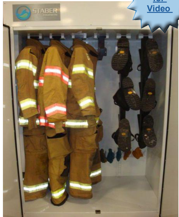
Model 2201-6 (820301)

5 years from the date of purchase, when this drying cabinet is operated and maintained according to instructions attached to or furnished with the product.