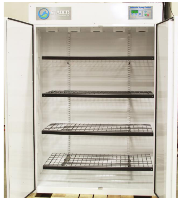
Model IDC-2230 (White Powder Coat Finish)

Ask us about our Laundry Equipment and extensive line of Dryers