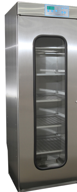
Model SDC-3SSGD (Stainless Steel with Glass Door)

Ask us about our Laundry Equipment and extensive line of Dryers