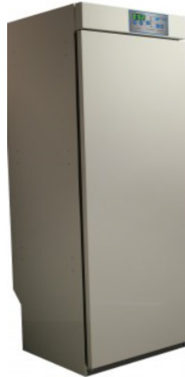
Model SDC—3 (White Powder Coat)

If required, ease of maintenance is one of the benefits of the Staber Single Door Drying Cabinet's design. The cabinet is designed to be end user repairable. There is total front/top access to all replaceable parts and few overall moving parts. A Factory Customer Service representative is available during normal business hours (Monday through Friday, 8AM - 3PM EST) and can be reached at 800-828-6200.