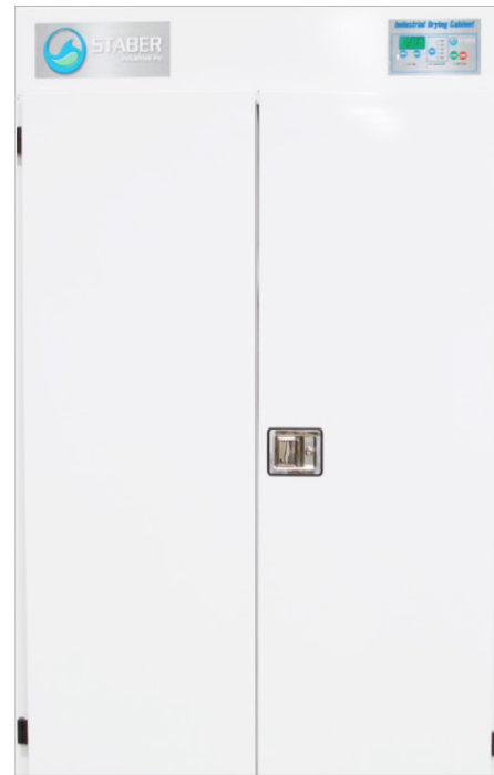
Model IDC-2230 (White Powder Coat Finish)

If required, ease of maintenance is one of the benefits of the Staber Commercial Drying Cabinet's design. The cabinet is designed to be end user repairable. There is total front/top access to all replaceable parts and few overall moving parts. A Factory Customer Service representative is available during normal business hours (Monday through Friday, 8AM - 3PM EST) and can be reached at 800-828-6200.